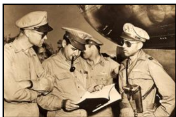
(Left to Right) Brig Gen Lauris Norstad, HQ 20 AF Deputy Commander; Maj Gen Curtis LeMay, XXI BC/CC; & Gen Thomas S. Power, 314 BW/CC; discuss the aftermath of MEETINGHOUSE on Guam.