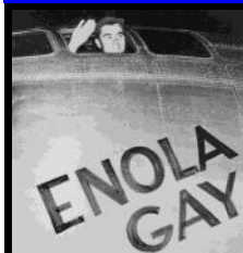
Col Tibbets waves from the cockpit of the B-29 "Enola Gay" while taxiing on North Field, Tinian, just before takeoff on the Atomic Bomb "Little Boy" Hiroshima mission.