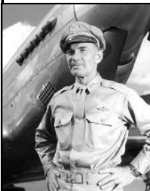
Lt Gen Millard "Miff" F. Harmon, Commander Army Air Forces Pacific Ocean Area (USAAFPPOA).

25 Feb 1945 — The 314 BW's first combat mission launched from North Field (AAFB), Guam, and participated in Operation MEETINGHOUSE #1, the first firebombing mission of Tokyo.