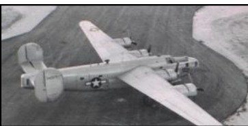
314 BW's Administrative C-87 (B-24) Liberator Express , nose art "Maximum Goose" was the first aircraft to ever land at North Field (AAFB) on 3 Feb 45.

3 Feb 1945 — North Field's (AAFB) RWY 06R/24L was declared operational when the 314 BW's administrative C-87 (B-24) Liberator Express was the first aircraft to land on the runway. The real celebration began when Maj Gen Curtis LeMay, new commander of the XXI BC, landed a F-13A (B-29) Superfortress at the field.