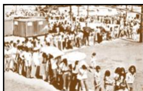
Vietnamese refugees in a line at "Tin City" AAFB, Guam., 1975.

18-29 Dec 1972 — Operation LINEBACKER II . When North Vietnam showed unwillingness to negotiate the end of the war, the Pres. Nixon unleashed the B-52s out of AAFB and U-Tapao. During this "11-Day War" there were over 153 B-52s on the ramp supported by an estimated 15,000 Airmen (a third of whom