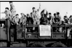
Airmen deployed from AAFB return to a Heroes' Welcome after Operation DESERT SHIELD & STORM in 1991.

c. Oct 1988 — The host 43d Bombardment Wing traded its nuclear deterrent role for a conventional mission, and in the next year began redeploying it B-