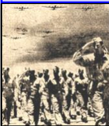
18 B-29s overhead & the 19 BW's Airmen marching in review during the dedication of AAFB.