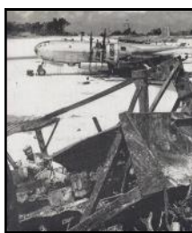
B-29s & bulldozer at North Field, Guam 1945.

4 Dec 1944 — Commander XXI Bomber Command (BC) moved from Saipan to Guam. Brig Gen Haywood “Possum” Hansell moved his command, from Isely Field, Saipan, to Guam Depot (Harmon) Field near Two Lover's Point. The same week marked the arrival of the 314th Bombardment Wing (314 BW) advanced echelon, the first command wing of North Field (Future Andersen AFB).