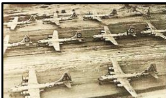
B-29s of the 58 BW, West Field, Tinian (Top) & 314 BW, North Field (AAFB), Guam, staged & loaded for the POW Supply Missions from Isley Field, Saipan.

2 Sep 1945 — "Show of Force" Over 400 B-29s conducted a flyover of Tokyo Bay during the surrender ceremony aboard the USS Missouri (BB-63). Although it was Surrender Day in Tokyo, it was a somber day at Northwest Field. A B-29B crashed on the field after developing engine problems while on a POW Supply Mission, 10 of the 12 crewmen were killed.