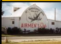
Rare color photo of the 19 BW Airmen's Club in 1952. (Bruce Young)

By mid-1946, the six heavy bomber bases in the Mariana Islands were reduced to just the three on Guam. Only North Field remained a heavy bomber base. Harmon Field became Harmon AFB and continued its logistical and maintenance mission. Northwest Field became a P-47 Thunderbolt fighter base. Both Harmon AFB and Northwest Fields closed in 1949. North Field, Guam, became Andersen AFB where construction of permanent structures was started.