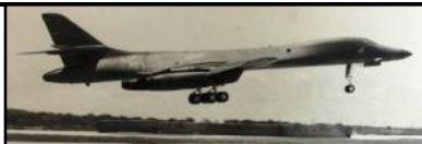
14 May 1988 — First Lancer . B-1B Lancer, S/N 85-0072, nose art "Polarized" landing at AAFB.

12 Oct 1983 — The Last Tall Tail . The last B-52D, known for their Vietnam Era black and camouflage paint scheme, departed AAFB. During Operation LINEBACKER II, the same B-52, S/N 56-0676, was the first B-52 to shoot down an enemy aircraft. It is currently on static display at Fairchild AFB, WA.