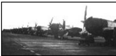
P-47N Thunderbolts of the 21st Fighter Group lined up on the Northwest Field’s ramp circa May 1946.

17 Apr 1946 - 3 Apr 1949 — Northwest Field (NWF) converted to a fighter base. First the 21st Fighter Group (FG) was assigned, then replaced by the famous 23 FG “Flying Tigers” from China. These Fighter Groups were equipped with P-47 Thunderbolts responsible for Marianas Air Defense. NWF became a storage for many access WWII aircraft from around the Pacific Theater.