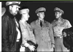
Greeted upon arrival in Washington are Generals: Curtis LeMay (far left), Emmett O'Donnell & Barney Giles (far right) pose with "Hap" Arnold (in tie).

27 Sep 1945-28 Feb 1946 — SUNSET PROJECT , with the war over with Japan, it was time to return the crews and B-29s from the 8th and 20th Air Forces, and the B-24's from the Far East Air Force. The flights were flown by combat crews operating under Air Transport Command (ATC) control and carried passengers assigned as extra crew members, all Airmen required to be eligible for separation. The returning bombers passed through the Marianas, Kwajalein, Johnston Island, and John Rodgers Field (Oahu) to Mather Field, CA. The flow continued the rest of the year into 1946. By New Year's Day 1946, 653 B-29's and 601 B-24's had returned to CONUS. The SUNSET PROJECT flights would