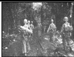
Marines moving up Salisbury-Tarague Trail during the last week of engagements on Guam, Aug 1945.