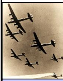
Formation of 314th Bomb Wing B-29s in formation.

5 May 1945 — B-29 Crewmen used in Experiments. The B-29, S/N 42-65305, 6th Bomb Sq., 29th Bomb Gp., took off from North Field (AAFB), Guam, on a bombing mission at Tachiarai Airfield, Empire of Japan. The bomber was rammed & crashed on Kyushu Island. Eight crewmen survived the bailout. Seven of them were used in medical experiments & killed at the Kyushu University Medical