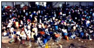
12 Jun 1991 — Operation FIERY VIGIL . The volcano Mt. Pinatubo, RP., erupted in close proximity to Clark AB. In the wake of the eruption, then a typhoon; more than 21,000 U.S. Military, family members, and pets evacuated from the Philippines. Eventually, all the evacuees made it to AAFB, Guam, for processing to CONUS. Photo: FIERY VIGIL evacuees being processed in one of the old metal hangars at Andersen.