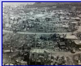
Super-Typhoon KAREN's total destruction of Guam's villages prompted the construction of buildings in concrete.

Following the KAREN Rebuild, apart from upgrades and beautification projects, AAFB saw very little new construction until after the 9/11 Attacks.