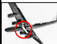
315 BW B-29B inflight shows the AQN-7 "Eagle" radar antenna underneath the wings.