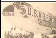
The first deployed B-52B to land was the "City of El Paso" S/N 53-0394.