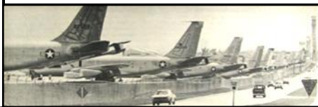
1972-1973 — Operation BULLET SHOT , there were so many large wing aircraft on AAFB's ramp that KC-135s were backed up on the old WWII B-29 hardstands with their tails hanging Arc Light Boulevard like trees!

1 Apr 1970 — 8AF moved to Guam . 8th Air Force replaced the 3d Air Division; the 43d Strategic Wing replaced the 3960th Strategic Wing; and the 4133d Strategic Wing (Provisional) inactivated at AAFB.