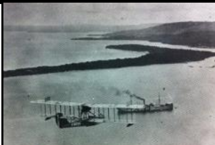
PFC Art Price, USMC, photographed this flight over Apra Harbor, Guam, in 1923.

13 Oct 1935 — A Pan Am flying boat, Hong Kong Clipper , Sikorsky S-42, on its first Trans-Pacific Survey Flight landed on Apra Harbor, Guam, and taxied into the newly completed flying boat base at the seaside village of Sumay.