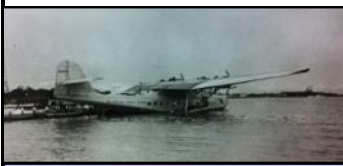
A Pan Am Martin M-130 flying boat, Village of Sumay, Guam circa 1935-1936.

22 Nov 1935 — Amid much fanfare, the first Pan Am Martin M-130 flying boat China Clipper launched from the waters of Alameda, CA with 1,837 pounds of mail; officially opened the Trans-Pacific route. This inaugural Trans-Pacific Airmail Flight passed through Guam, 27-28 Nov 1935.