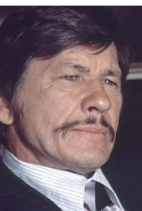
Airman Charles D. Buchinsky was a gunner on a B-29, with the 61st Bomb Sq., 39th Bomb Gp., North Field (AAFB), Guam. He flew 25 combat missions & received a Purple Heart. He is more well-known as actor Charles Bronson (1921-2003).

21 Oct 1944 — The first USAAF flying unit assigned to Guam. The 11th Bombardment Group (BG), 7th Air Force (7 AF), arrived on Guam, temporally assigned to the Navy's Agana Field. Their B-24 Liberators immediately conducted bombing missions against the Japanese-held island of Palau in support of Gen MacArthur's amphibious landings at Leyte, Philippines. The 11 BG would eventually move down the hill to Guam Depot (Harmon) Field.