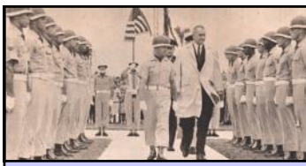
21 Mar 1967 — Super DV Day . President Johnson, South Vietnam President Nguyen Van Thieu, & PM Nguyen Cao Ky; plus, all of the President's Cabinet visited AAFB. President awarded 12 B-52F Crew-dogs with medals & spoke in front of the current 36 WG HQ, in the rain. It was also the first time Andersen Radio broadcasted a live event to AFRT & around the world.