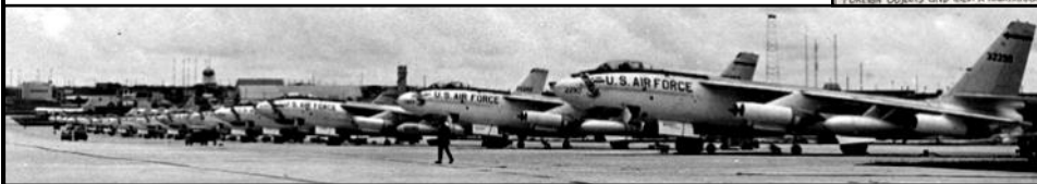
15 B-47s lined up on the South Ramp, AAFB, circa 1956.