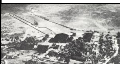
Pan Am Facilities, Sumay, Guam, 1935-41.

8 Dec 1941 — The Pan Am Philippine Clipper heard that Guam had been attacked. It was on a routine flight from Wake Island to Guam carrying a Flying Tiger pilot and cargo full of airplane tires bound for China. The Clipper returned to Wake Island where it sustained 60 bullet holes from Japanese strafing attacks. Then loaded with as many people possible and returned safely to Hawaii. The start of WWII ended Pan Am's Trans-Pacific routes. All Clippers were transferred to the US Navy.