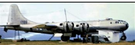
The hulk of B-29A S/N 44-61789, being used as the Pati Point Gunnery School on Andersen AFB. It’s wreckage remains over the cliff line today.

2 Aug 1947 — 54th Reconnaissance Squadron (VLR) Weather (54 RSW) arrived at North Field, Guam. 54th specialized in early typhoon detection and monitoring. It would inactivate, active, and change designations of its long rich history.