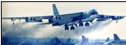
12 Feb 1972 — Operation BULLET SHOT , SAC's 5-phase mission to bring more B-52s into Southeast Asia in response to intelligence reports North Vietnam planned to invade South Vietnam. Over 200 B-52s, crews, and maintainers rotated through Guam and U-Tapao AB, Thailand, for the next 18 months.

27 Jul 1969 — B-52D Crash . BUFF, S/N 56-0630, attached to the 4133 BS (P), AAFB, suffered structural failure just after lift-off from AAFB and crashed into the ocean, no survivors.