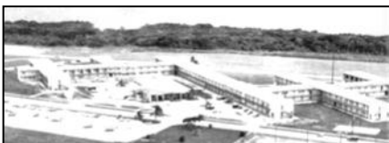
Aerial view of Bldg. 21000 when it was the Headquarters of the 3960th Air Base Wing in 1955

N 44-61700 launched from North Field, Guam, and was