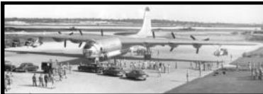
1st B-36J Peacemaker arrived at AAFB, 1 Oct 1954. It carried the 92 BW's ADVON team. The rest of the Wing arrived 16 Oct 1954.