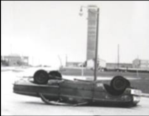
Super Typhoon Pamela's destructive nature can be seen in this photo. In the background, all the windows, except one, were blown out of the tower.

23 Dec 1975 — YOUNG TIGERS Ceased Ops . The last KC-135 Stratotankers still operating under the