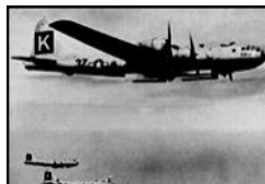
B-29 "Colleen" flies in a 330 BG formation. Colleen was named for the pilot's one year old daughter. She visited the crash site in 2002.

16 Jul 1945 — 20th Air Force (AF) moved to Guam . From Gen Henry "Hap" Arnold's office in Washington D.C. to Harmon Field near Two Lovers Point. It was assigned to the United States Strategic Air Forces in the Pacific (USSTAF) along with the Gen Jimmy Doolittle's 8 AF, Okinawa, part of the Pacific reorganization.