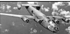
Guam assigned 98 BS, 11 BG, B-24J Liberator , S/N 42-109951, nose art, “Madam Pele.” Japanese-American high school students in Oahu, HI, raised & donated $350k to have this B-24 built.

8-10 Aug 1944 — The Last Tank Battle on Guam took place on current Andersen AFB property. Marines first sighted Japanese medium tanks near pre-war Salisbury-Tarague Trail (Near today's Main Gate) and the chase/battle ended on the road that leads down Tarague Beach. Several M4 Sherman tanks fired on seven enemy medium tanks in a short exchange of fire. The crews abandoned the tanks and retreated over the cliff line.