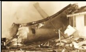
B-29 tail leaning against on a house after the 17 Dec 1953 Crash.

17 Dec 1953 — Worst Accident in AAFB History . B-29MR Superfortress , S/N 44-87741, 9 BW, redeploying to Mountain Home AFB, ID, suffered engine failure and crashed into Jennings Manor Officers' Housing while attempting to land. The crash killed nine crewmembers and passengers. Additionally, 10 men, women, and children on the ground were killed.. Typhoon DOLLY occurred and two USN aircraft were lost the same week.