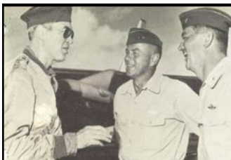
21 Feb 1966 , Brig Gen Jimmy Stewart, USAFR, famous Actor (Left) flew a B-52F ARC LIGHT mission from AAFB during Vietnam. Gen Crumm is in the center of the photo.

8 Jul 1967 — B-52 Misfortune Da Nang . B-52D, S/N 56-0601, attached to the 4133 BW (P), AAFB, diverted to Da Nang, South Vietnam, for an emergency landing because of electrical and hydraulic systems problems. Upon landing the bomber overran the end of the runway, broke up, and caught fire in a mine field. All forward crewman were killed. The gunner was the only survivor.