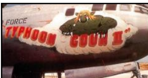
Nose art "Typhoon Goon II" 54 SRS (W), WB-29 S/N 44-69970.

12 Apr 1951 — Black Thursday . (Yalu River Bridge Mission) 48 B-29s escorted by 76 fighter jets were attacked by 36 MiG-15s flown by top Soviet pilots. Seven B-29s were lost, five of them from the 19 BG. After which, B-29 gunners were sent to Pati Point Gunnery School on AAB's cliff line. The school used the hulk of a WWII veteran B-29A. On 23 Oct 1952, was another bad B-29 vs MiG day, known as "Black Tuesday."